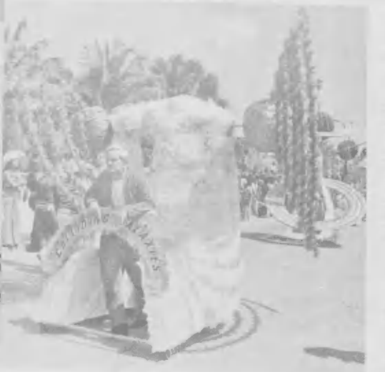
Outer Space Group